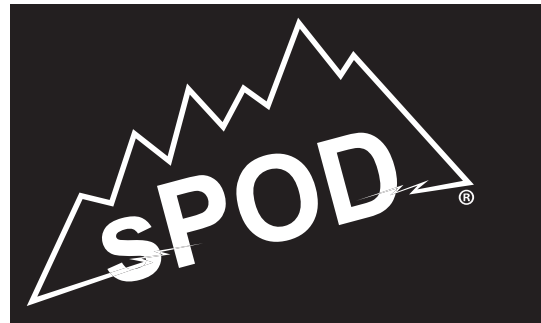
White Logo (Dark Background)