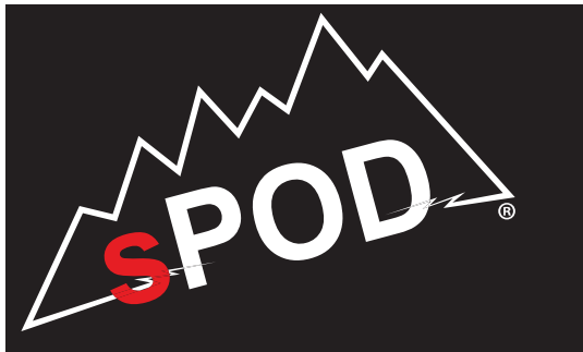
White/Red Logo (Dark Background)